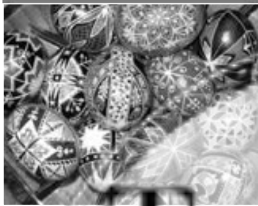
A basket of decorated pysanky